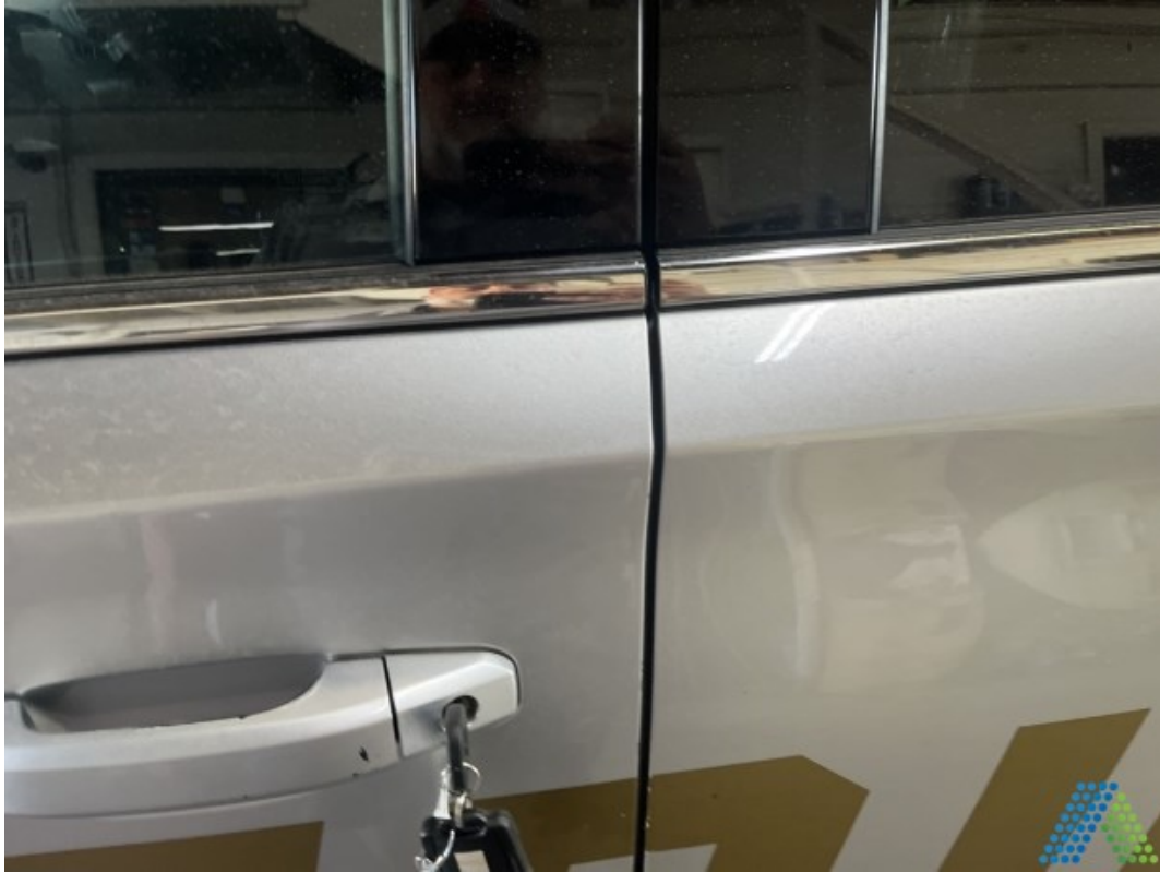
Document Name: Photo 45.jpg