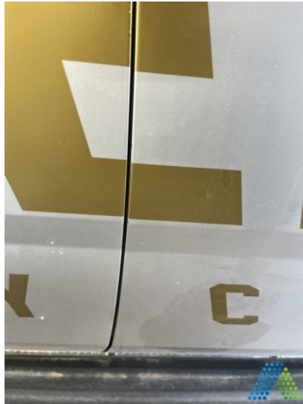
Document Name: Photo 41.jpg