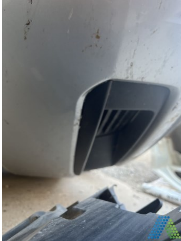
Document Name: Photo 03.jpg