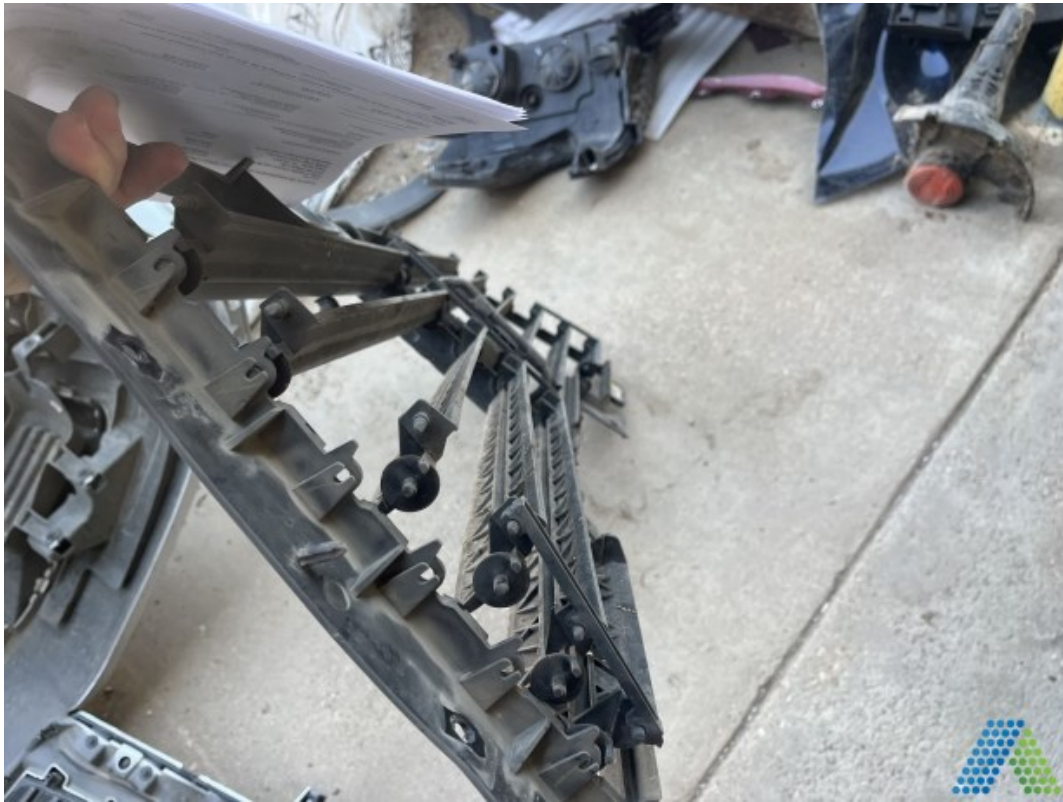
Document Name: Photo 13.jpg