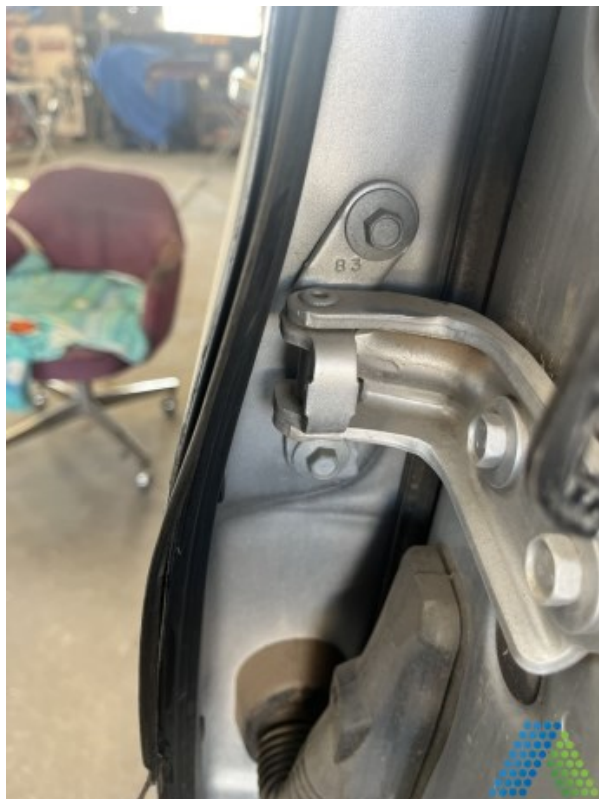
Document Name: Photo 38.jpg