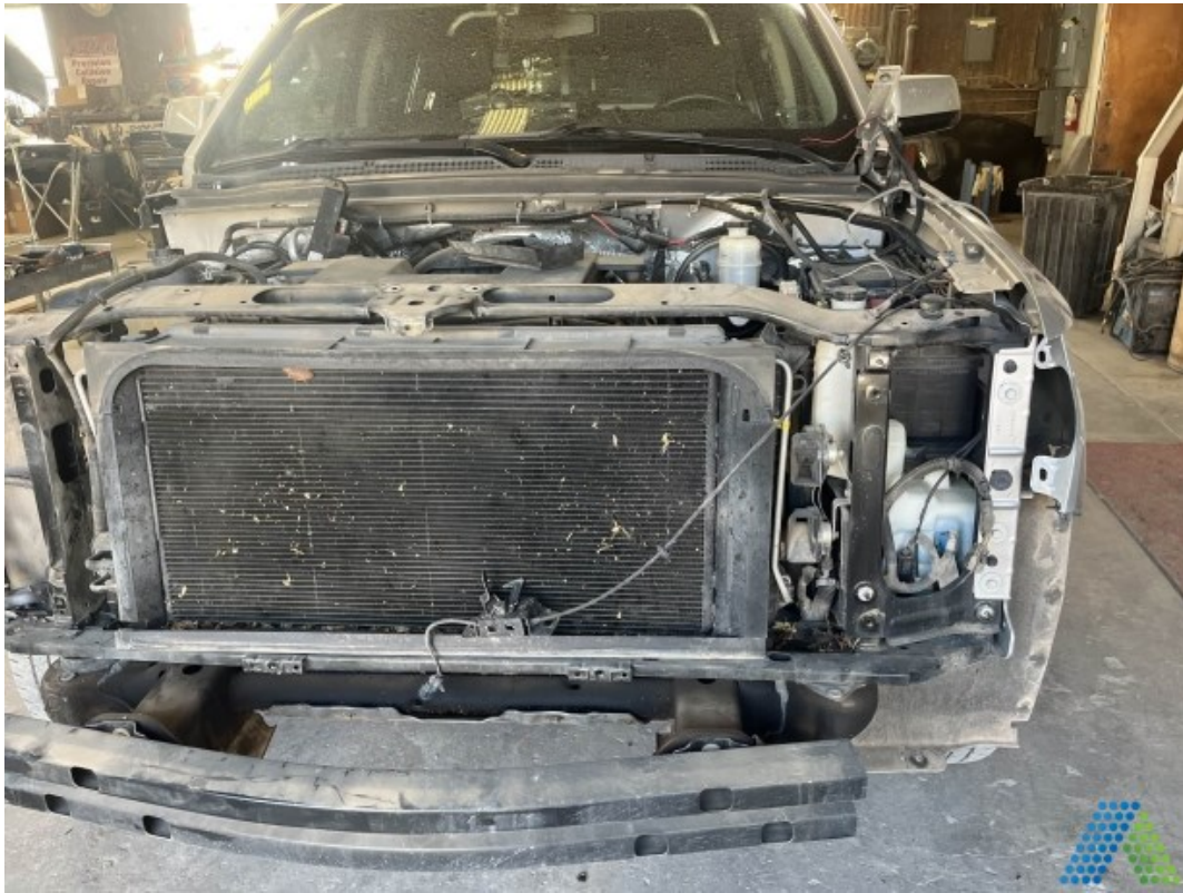
Document Name: Photo 19.jpg