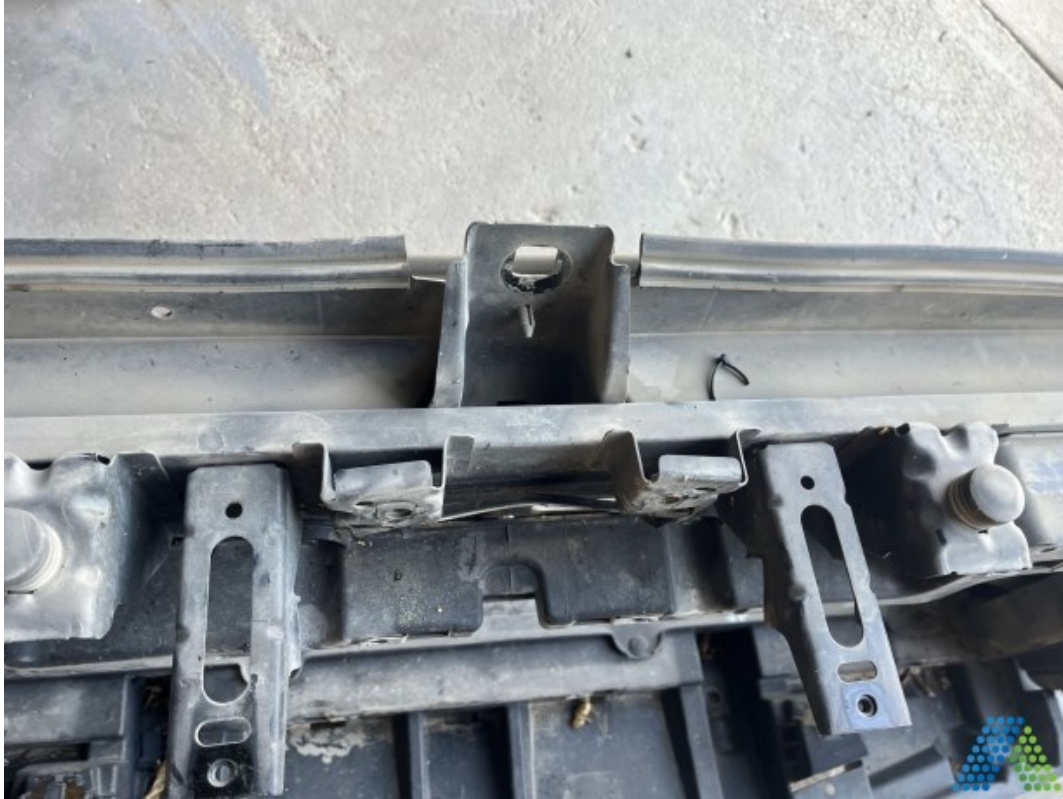
Document Name: Photo 17.jpg