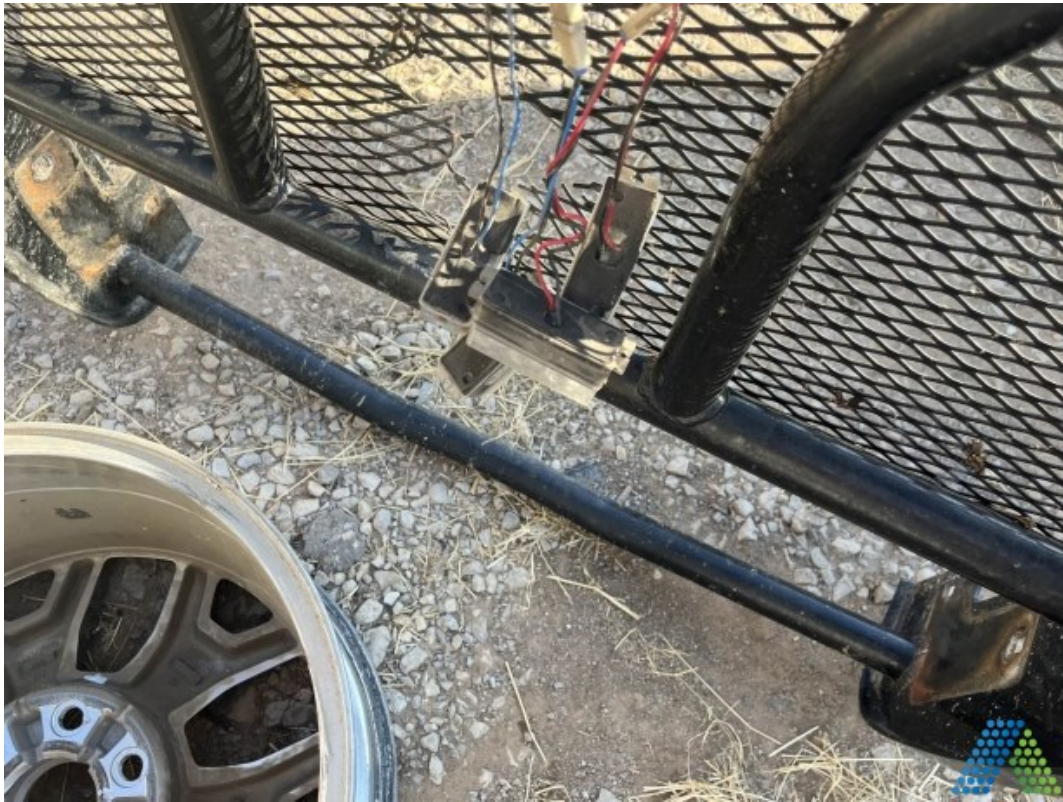
Document Name: Photo 55.jpg