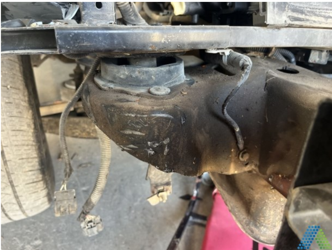
Document Name: Photo 34.jpg