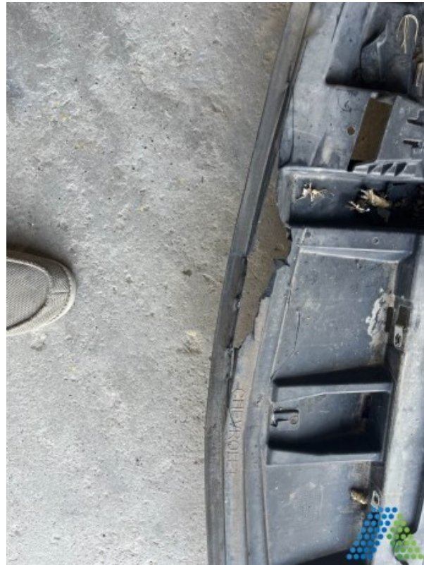
Document Name: Photo 15.jpg