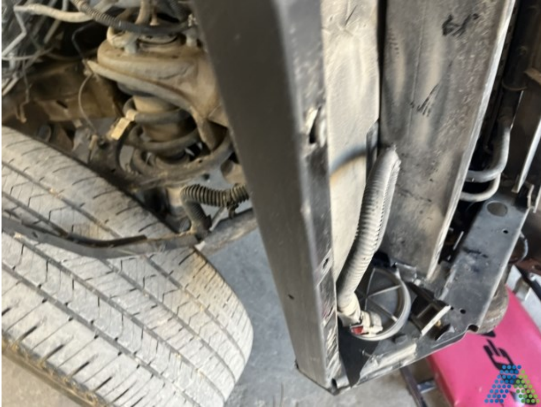
Document Name: Photo 33.jpg