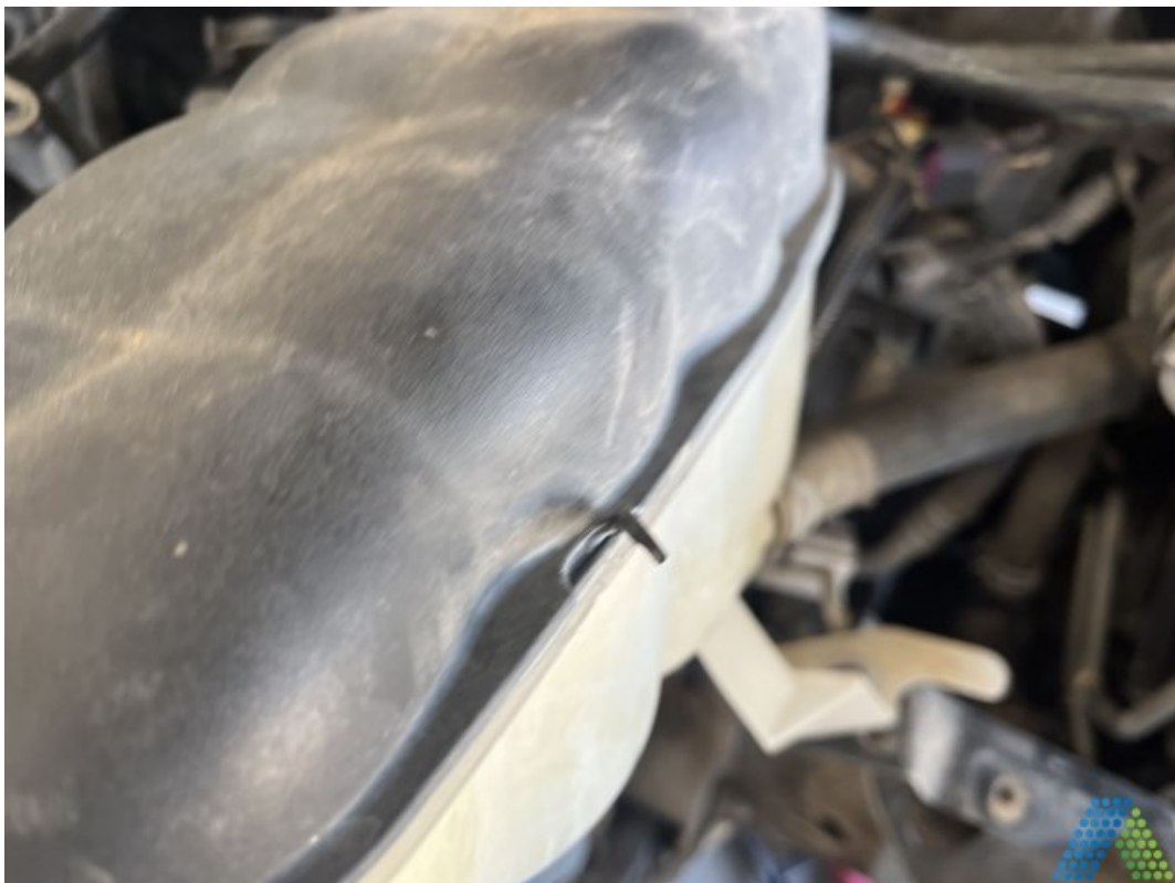
Document Name: Photo 32.jpg