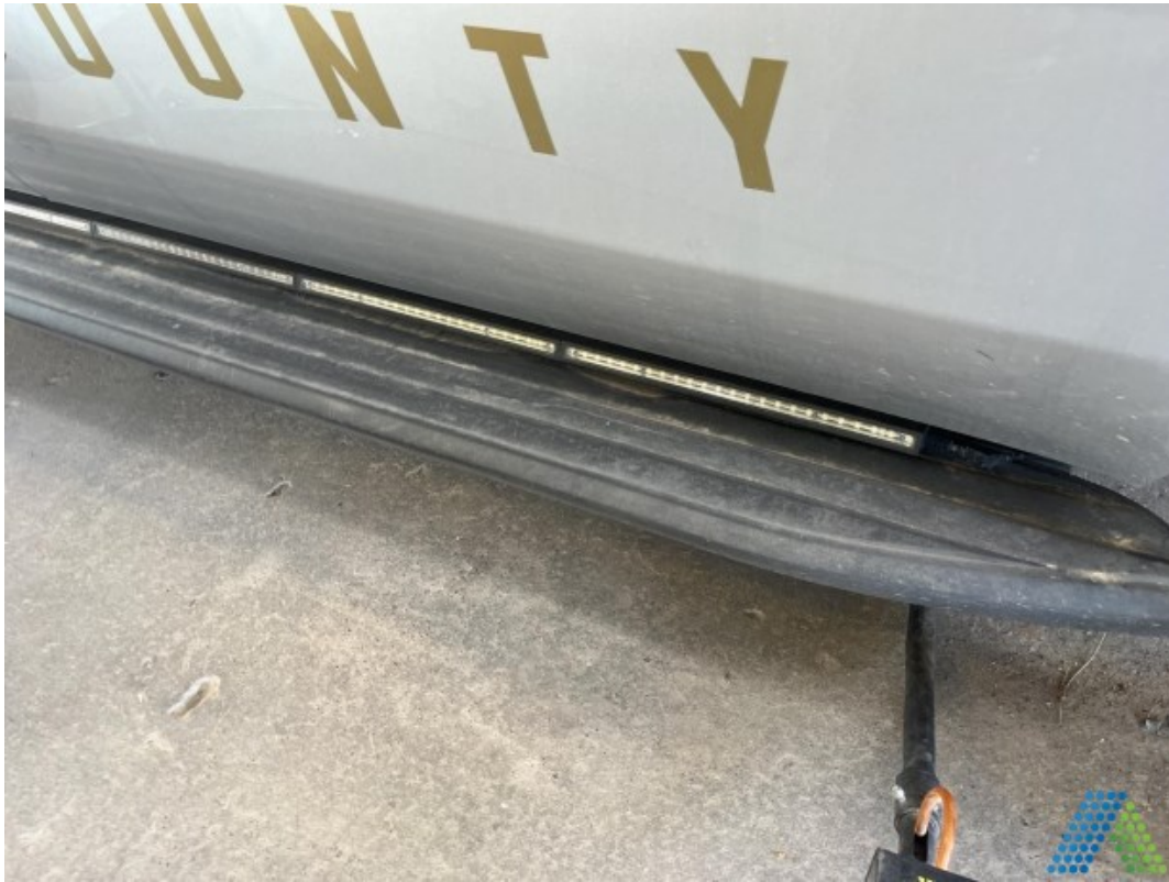
Document Name: Photo 51.jpg