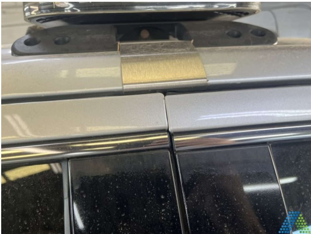
Document Name: Photo 42.jpg