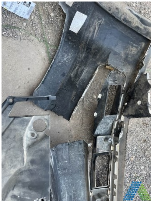
Document Name: Photo 04.jpg