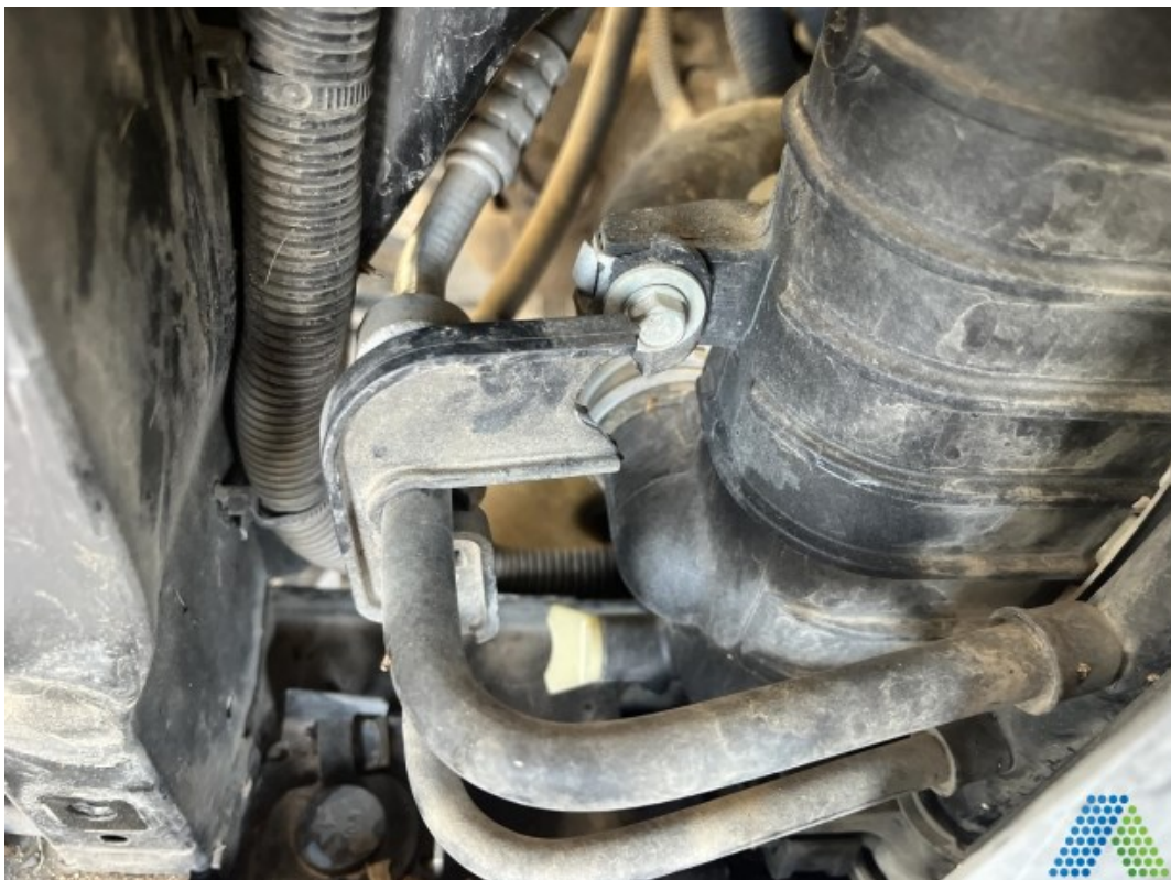
Document Name: Photo 58.jpg