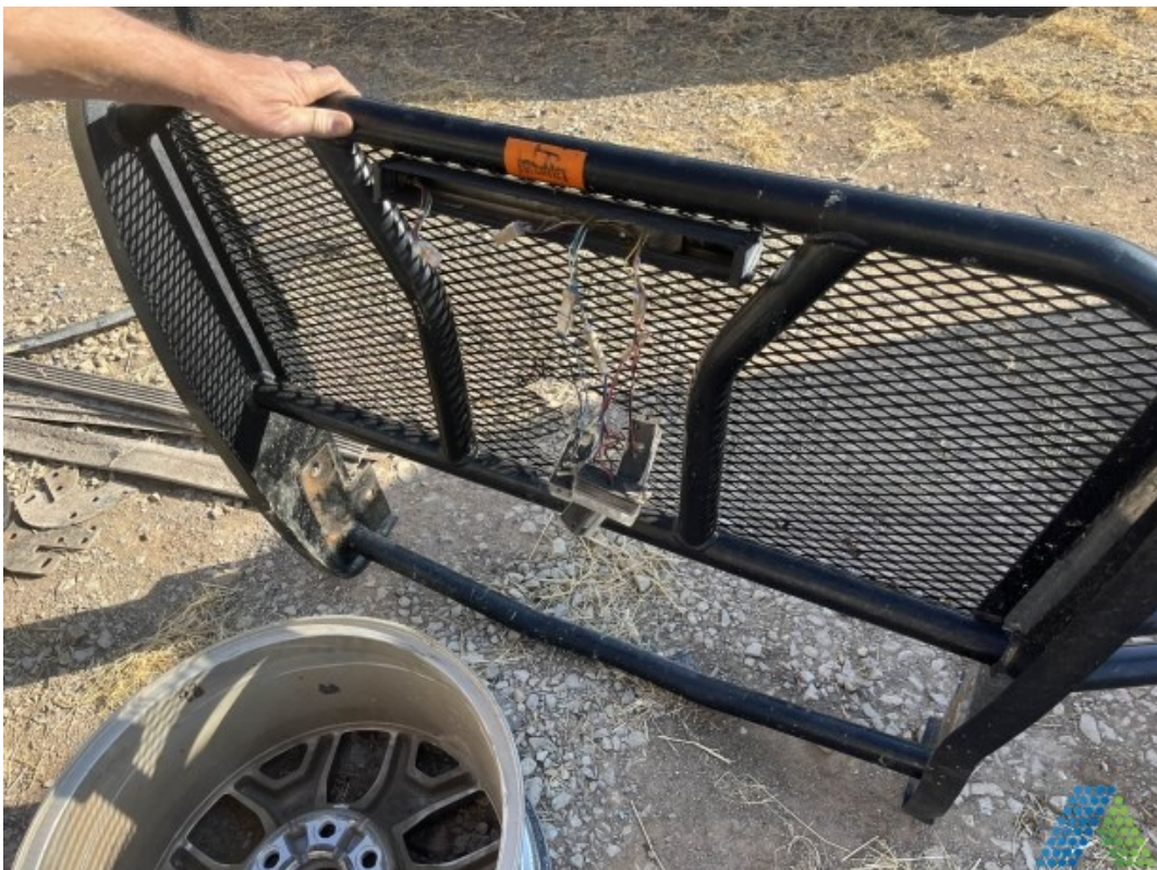
Document Name: Photo 54.jpg