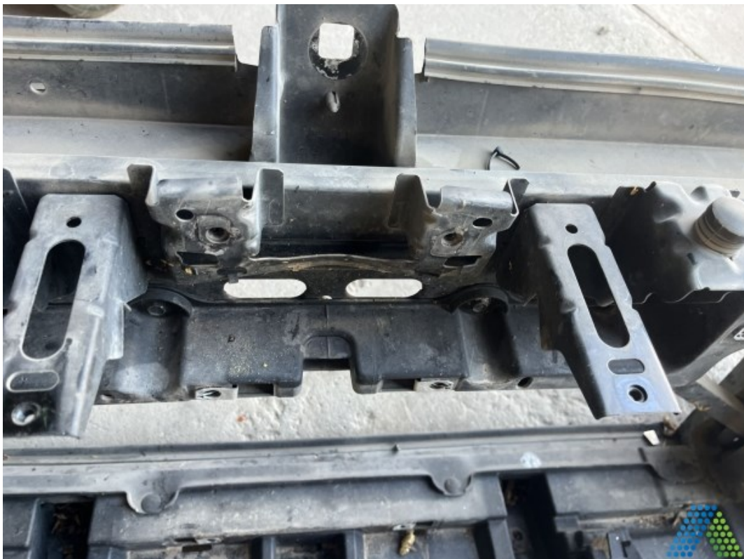
Document Name: Photo 16.jpg