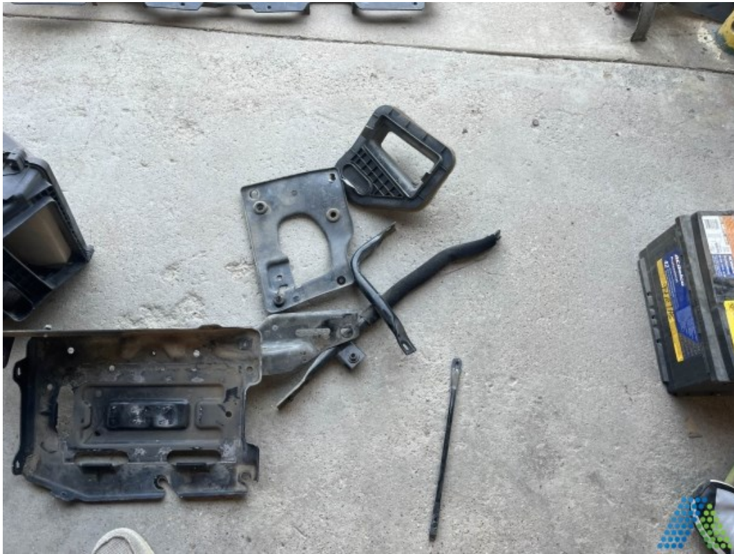
Document Name: Photo 27.jpg