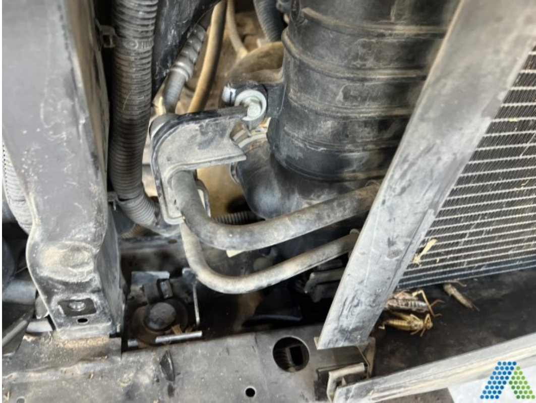
Document Name: Photo 57.jpg