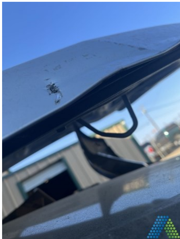
Document Name: Photo 08.jpg