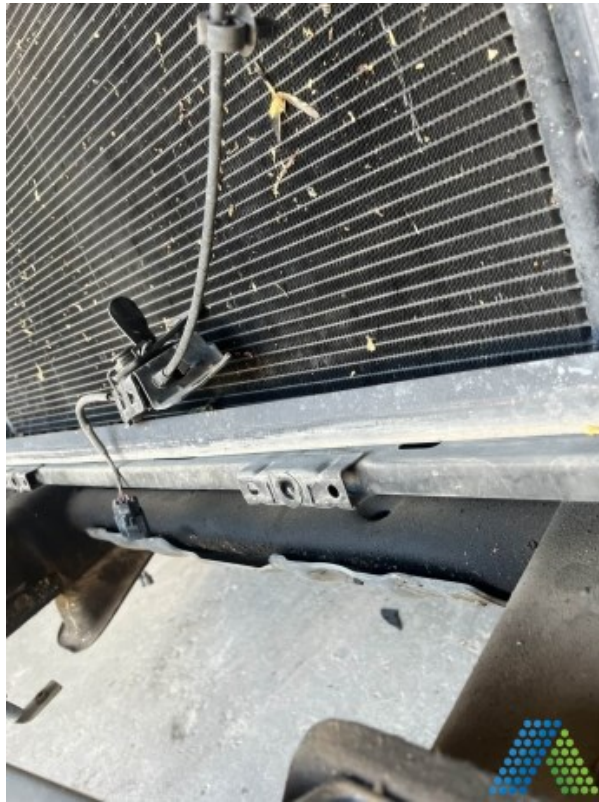
Document Name: Photo 21.jpg