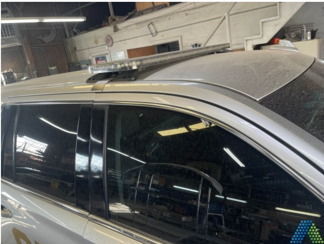
Document Name: Photo 48.jpg