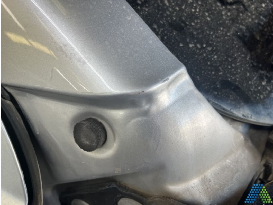
Document Name: Photo 47.jpg