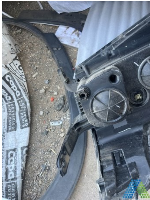
Document Name: Photo 11.jpg