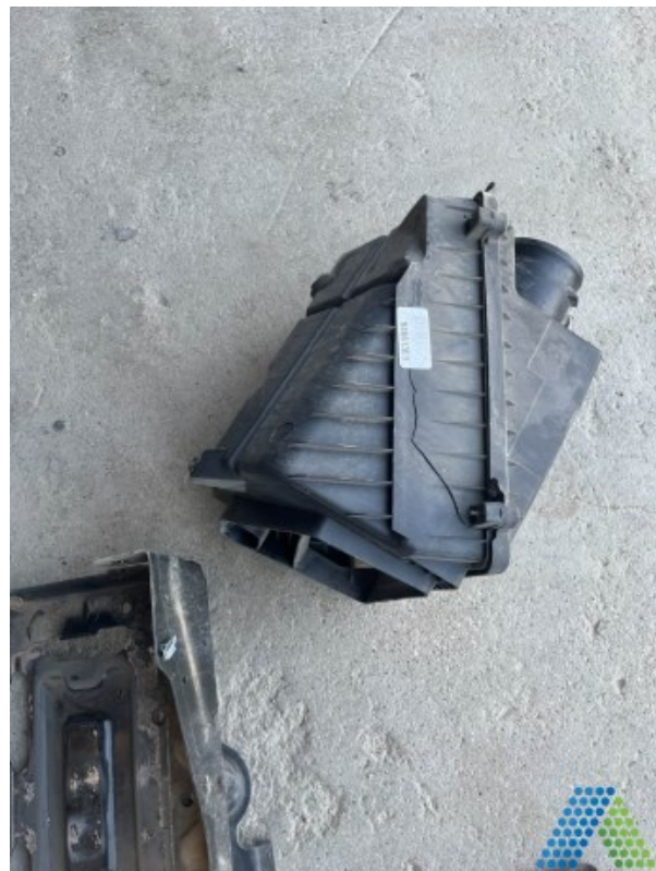
Document Name: Photo 28.jpg