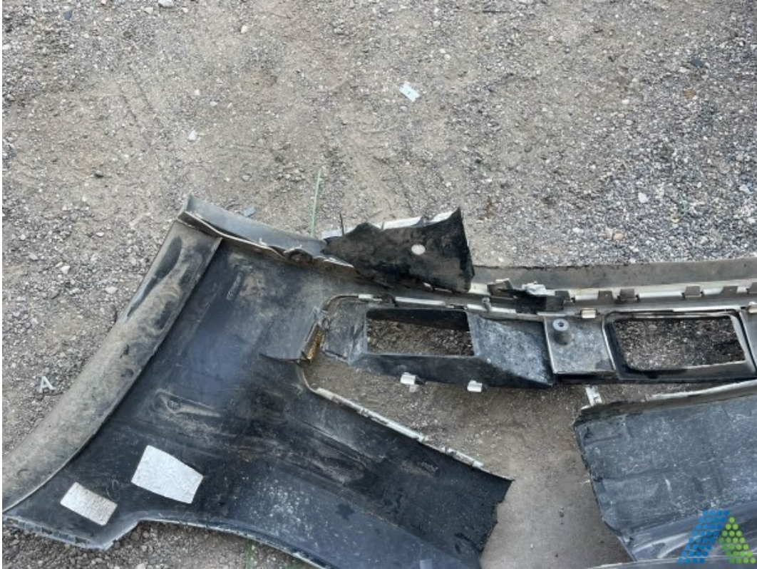
Document Name: Photo 05.jpg