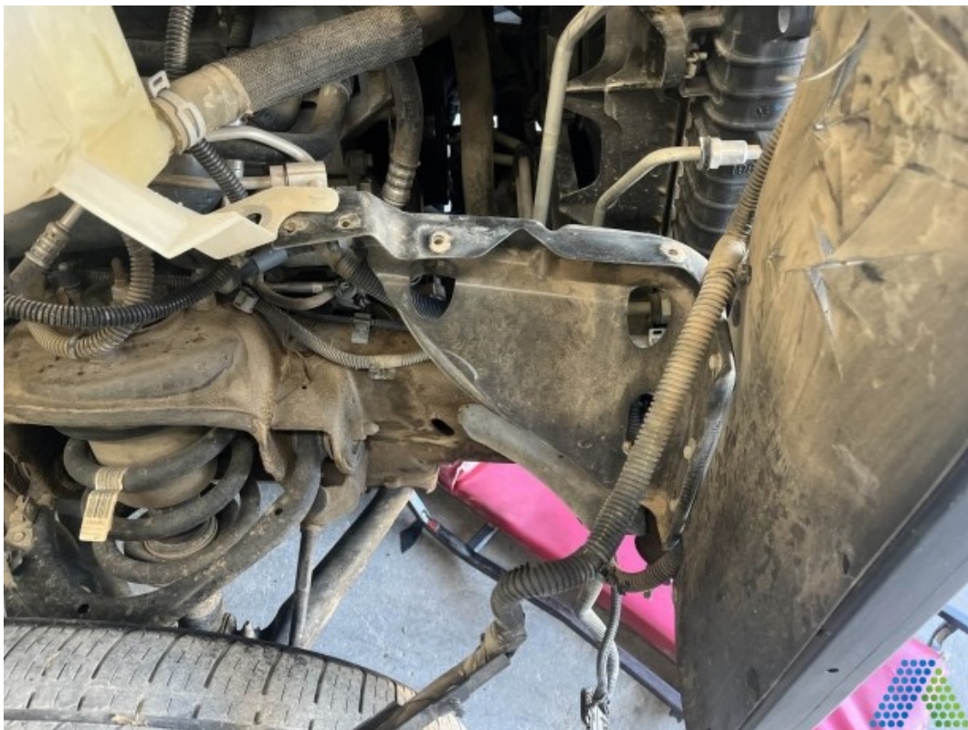
Document Name: Photo 24.jpg