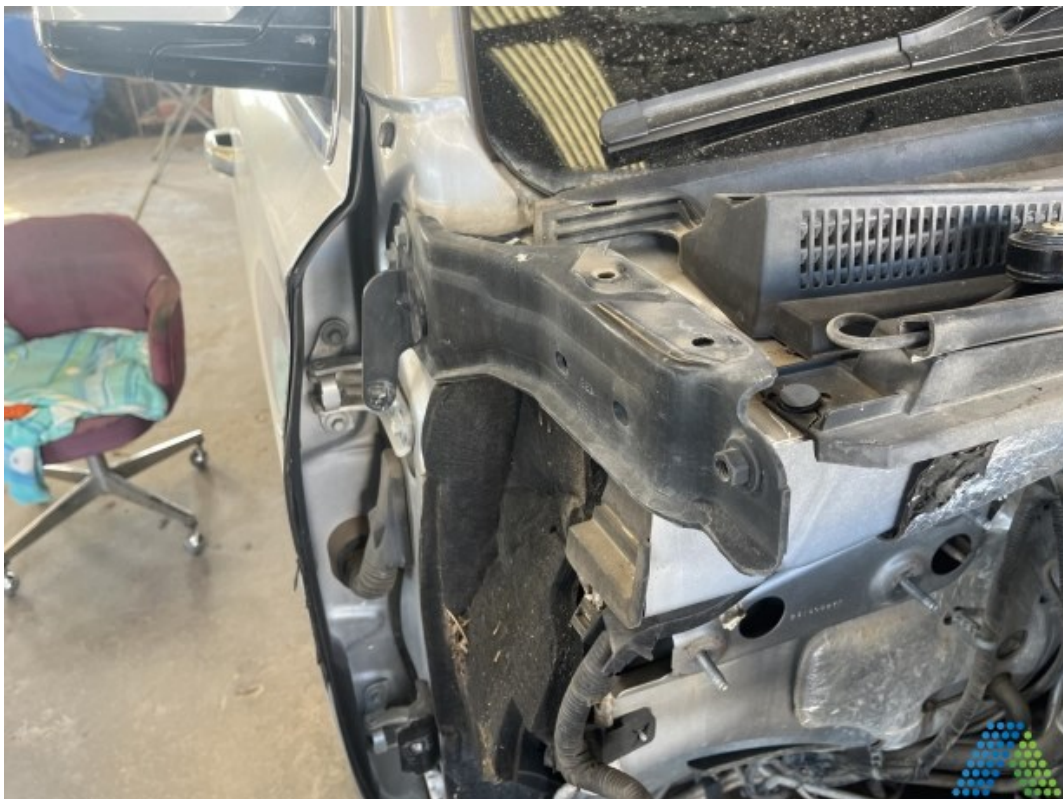
Document Name: Photo 30.jpg