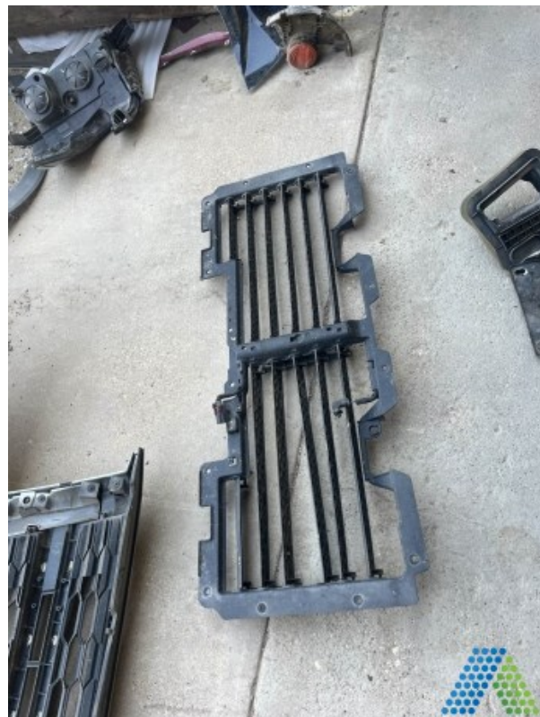
Document Name: Photo 12.jpg