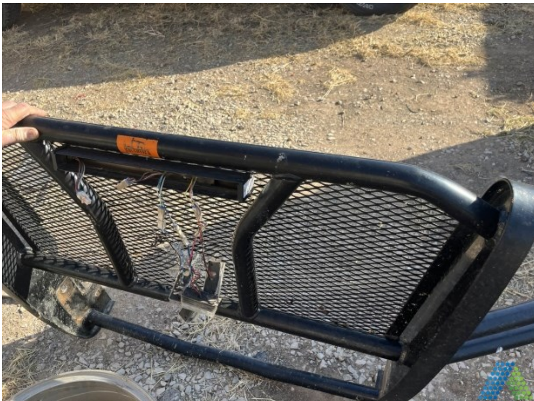
Document Name: Photo 56.jpg