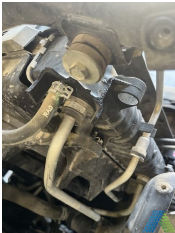
Document Name: Photo 22.jpg