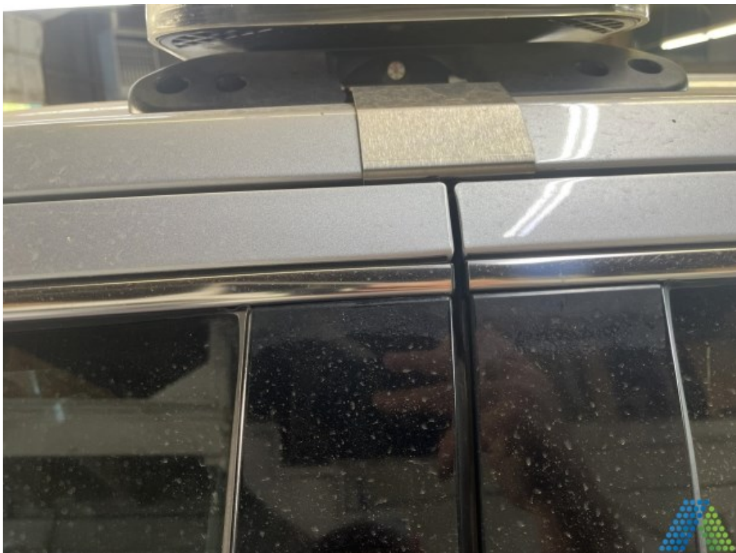
Document Name: Photo 46.jpg