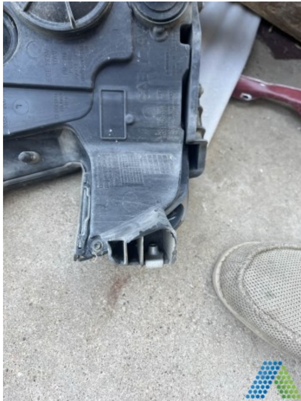
Document Name: Photo 10.jpg