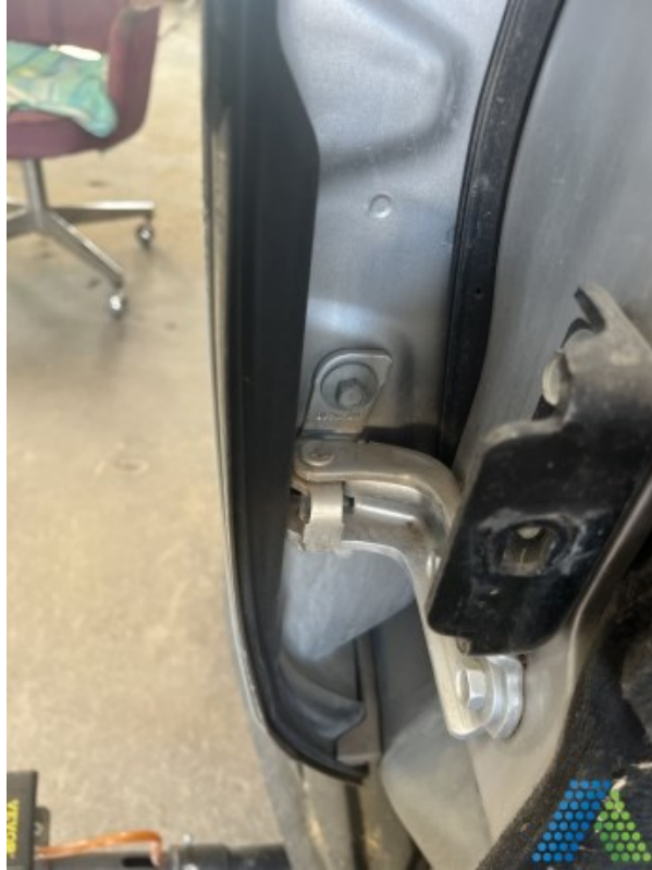
Document Name: Photo 39.jpg