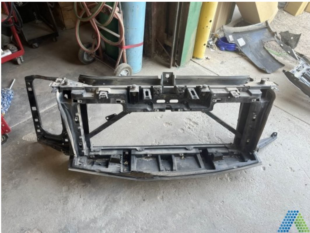
Document Name: Photo 14.jpg