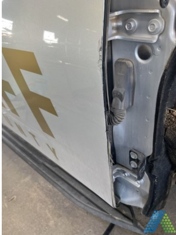
Document Name: Photo 37.jpg