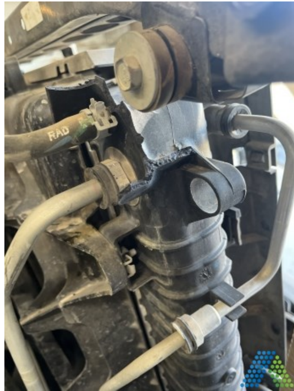
Document Name: Photo 23.jpg