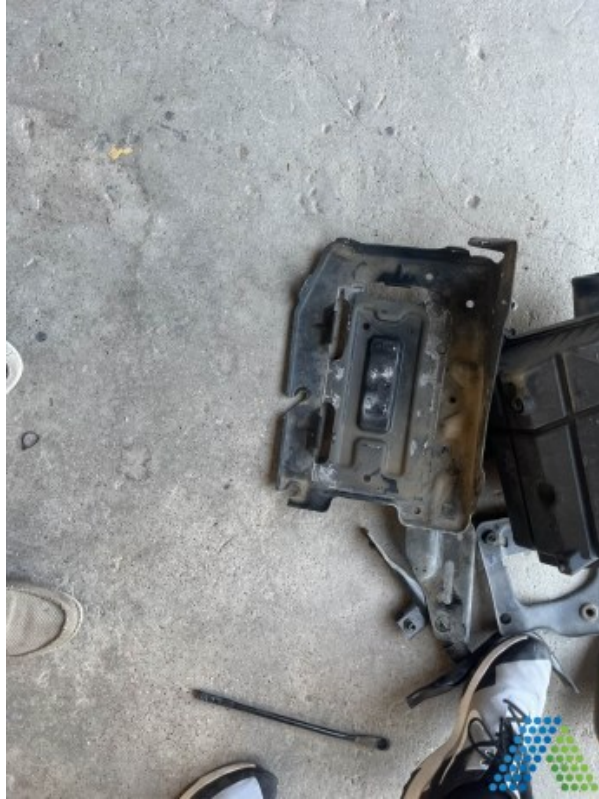
Document Name: Photo 25.jpg