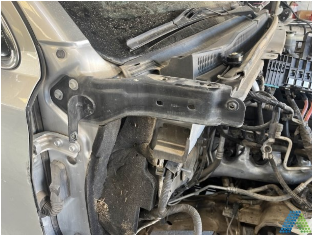
Document Name: Photo 29.jpg