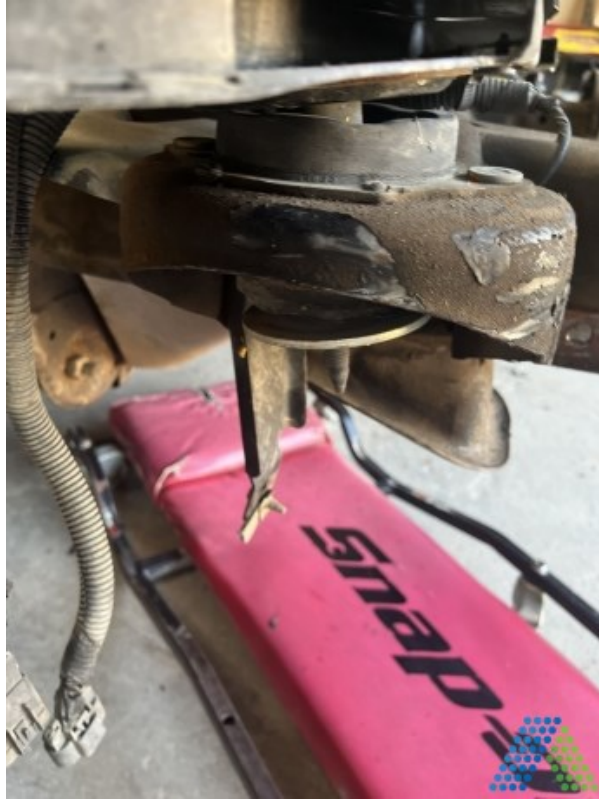
Document Name: Photo 35.jpg