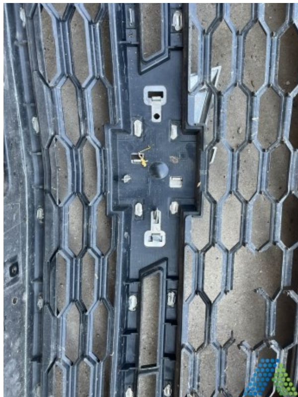
Document Name: Photo 06.jpg