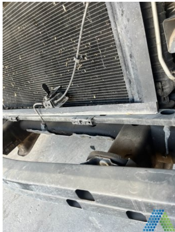
Document Name: Photo 20.jpg