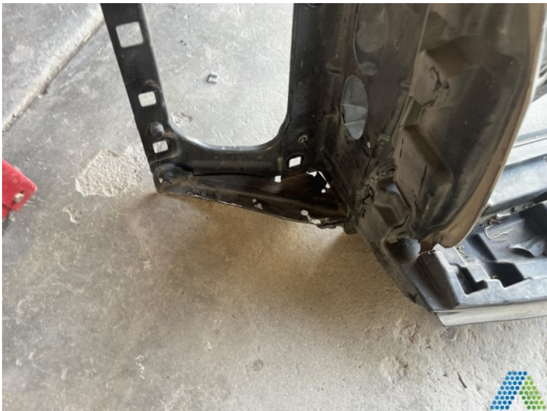
Document Name: Photo 18.jpg