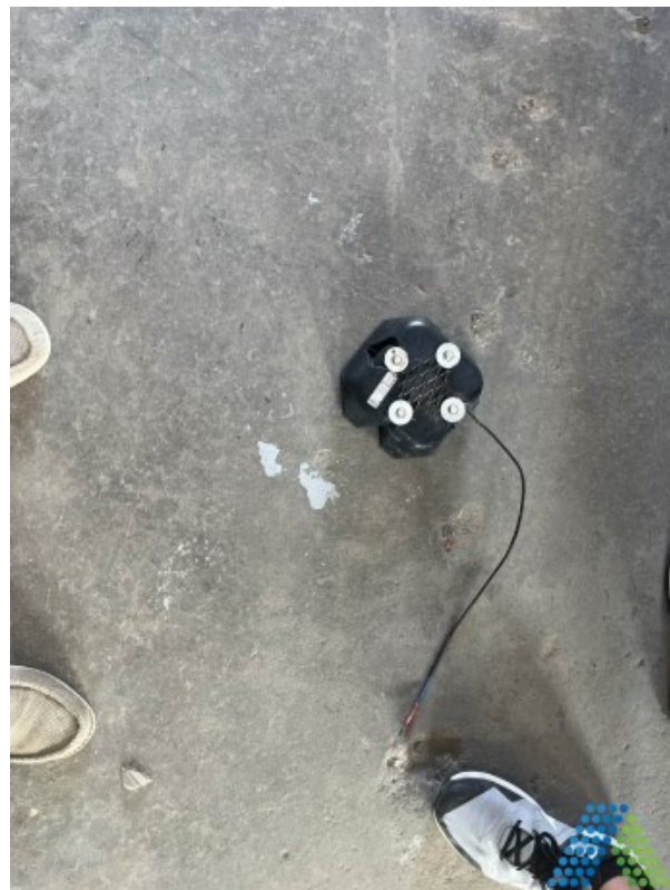
Document Name: Photo 52.jpg