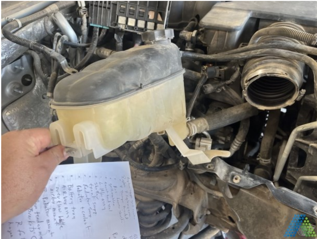
Document Name: Photo 31.jpg