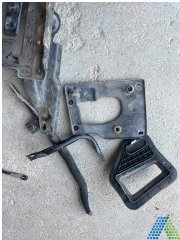
Document Name: Photo 26.jpg