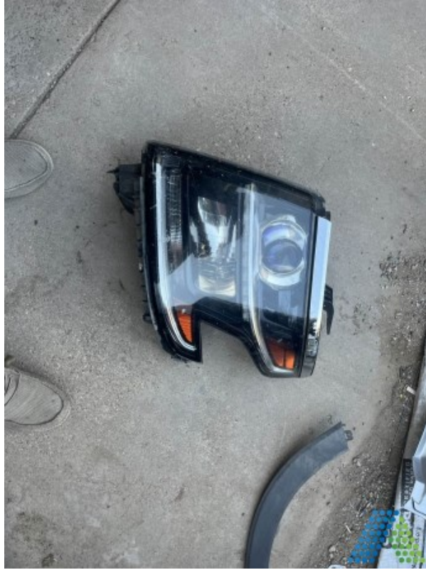
Document Name: Photo 09.jpg