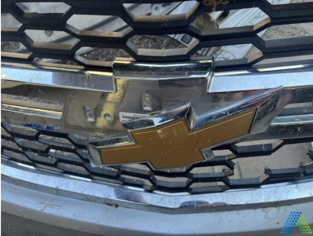
Document Name: Photo 07.jpg