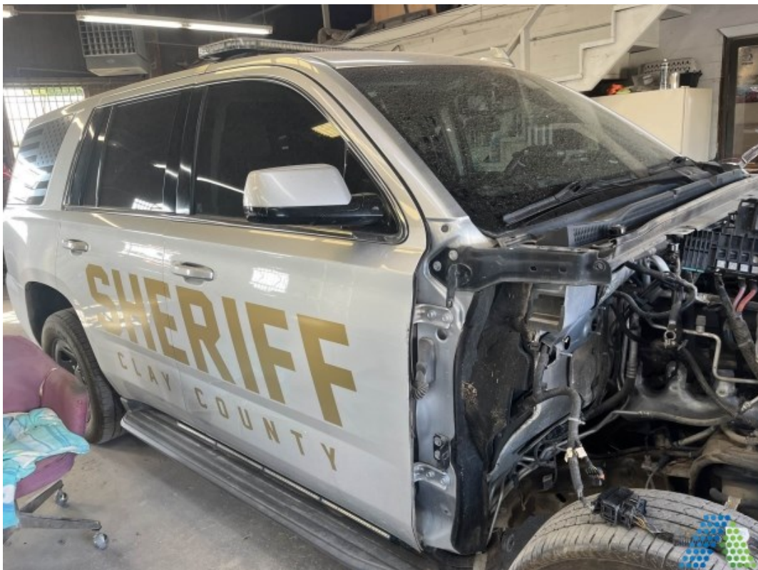
Document Name: Photo 36.jpg