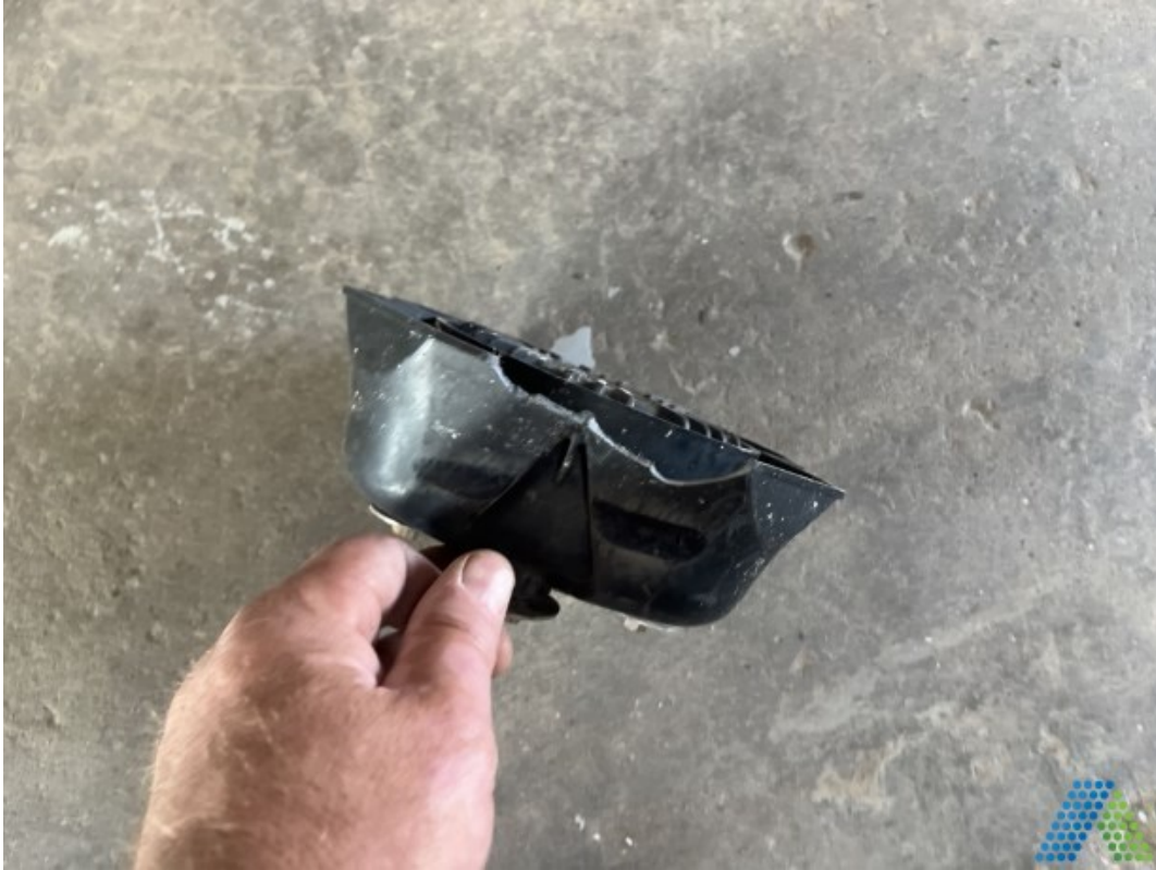
Document Name: Photo 53.jpg